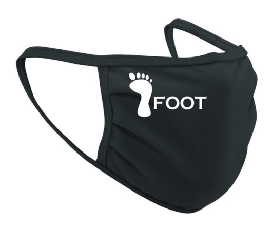
During August Pre-FOOT Training, what's this? A Hurricane?

However, we were now facing the Delta Variant. Vaccinations, Testing and Masks required. We will beat this virus!