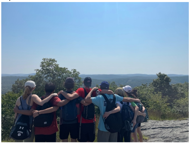
Hello! Some happy campers