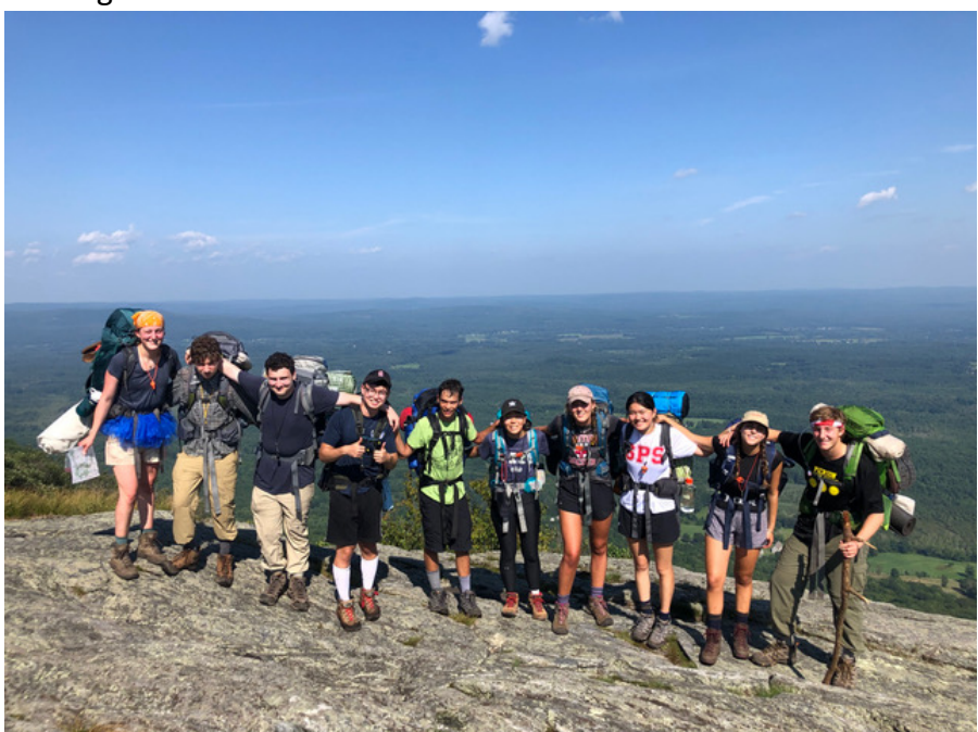
Taking in the view