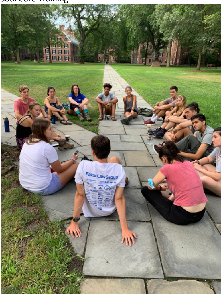
Our Fearless Poobahs