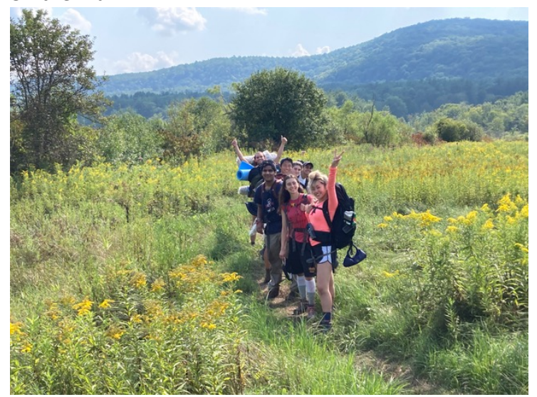
Starting to bond