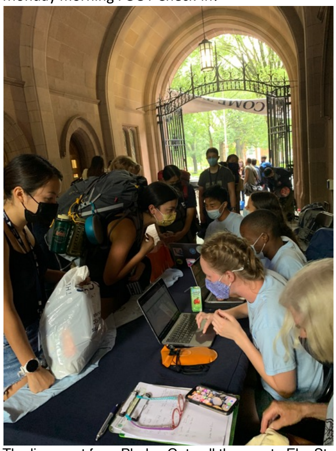
The line went from Phelps Gate all the way to Elm Street!!! (We had 100 extra students this year!)