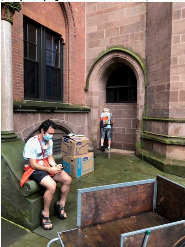
We can double up in the Berkshires! Yippee!