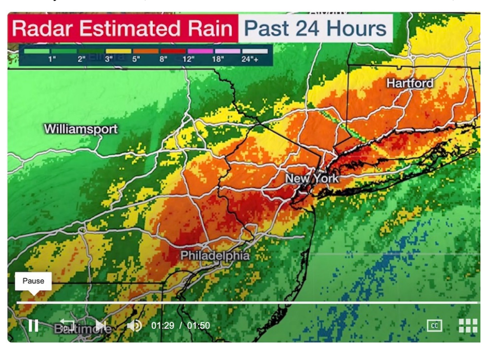
What Caused Northeast Flooding, Tornado Disaster?

A few days after FOOT, Ida Hurricane hits the Northeast. But on FOOT, NO RAIN! A miracle!!